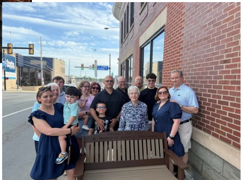
Above: The Fontanella Family