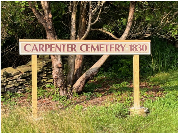
New sign: planned and paid for by Scott Lions, with help from a special friends of the lions.