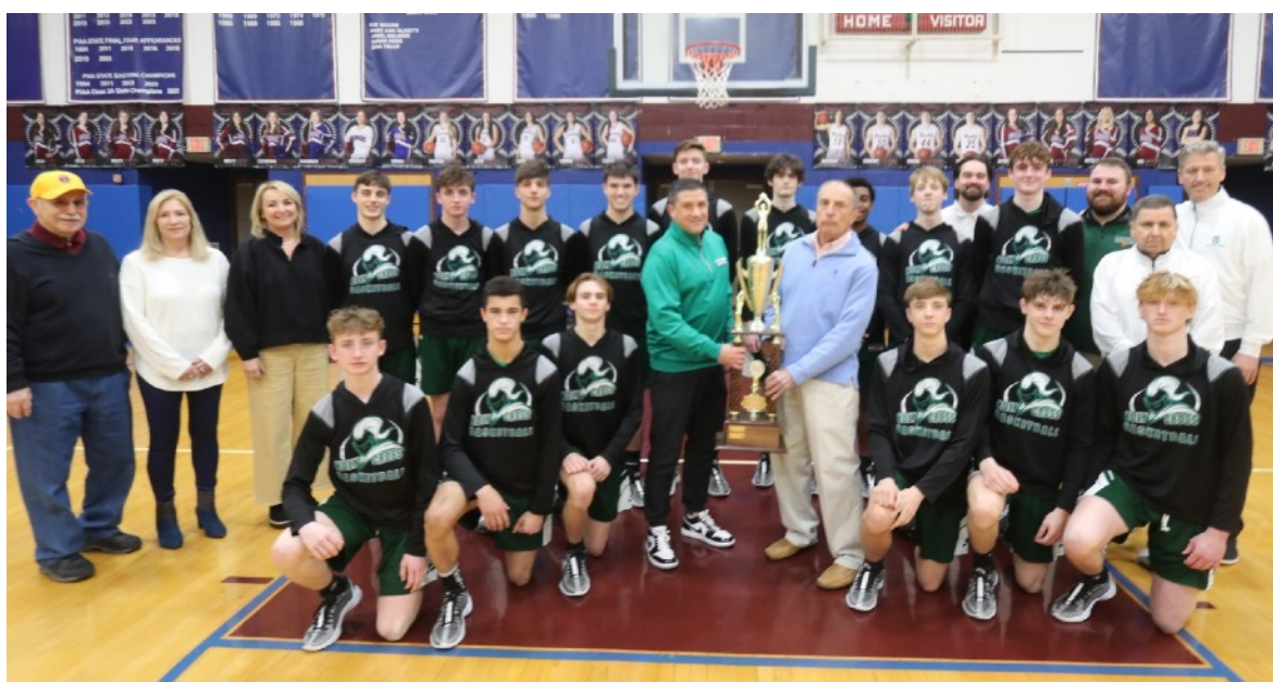
Holy Cross Boys