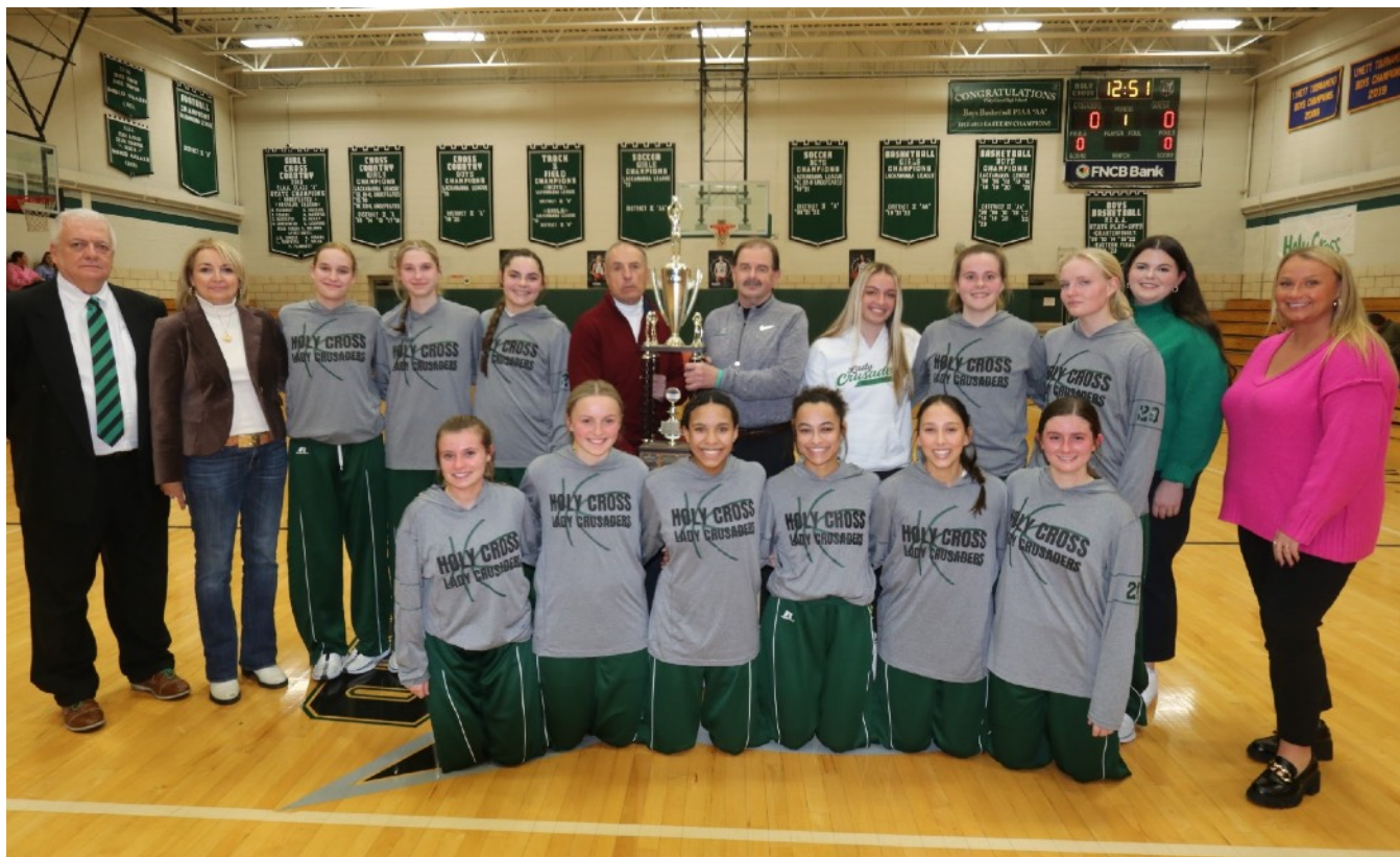
Holy Cross Girls