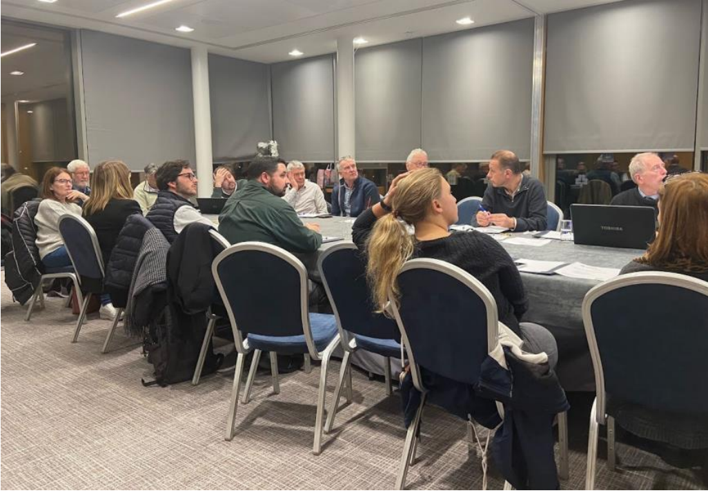
Photo 2: Dublin Lions look on to a powerpoint presentation during a discussion