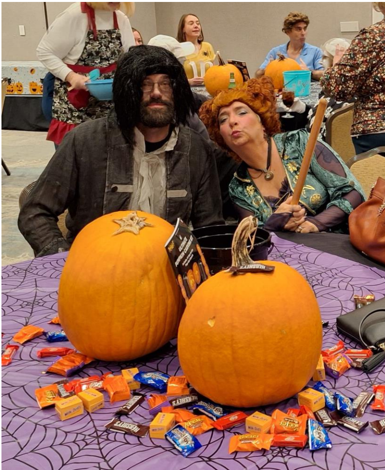
1 Hocus Pocus characters.