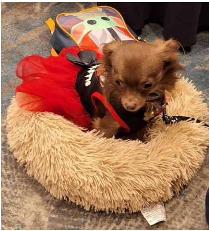
4 Great Dane that got caught in the rain.