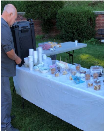
Traveler fills up a cup of coffee

For somewhere around 10 years now, the members of the Abington Lions Club have given up Holiday weekend time to go up on Rt-81 and pass out coffee, snacks, and hot dogs to travelers who stop at the rest stops.