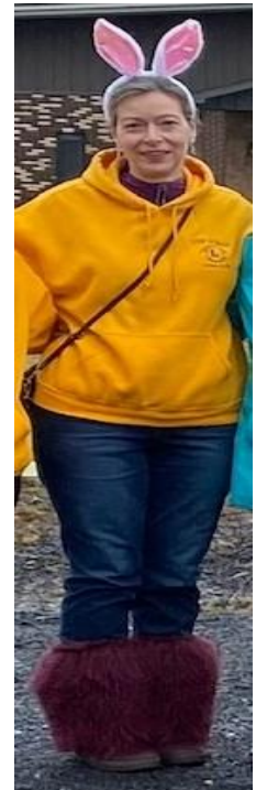
Love those Bunny boots