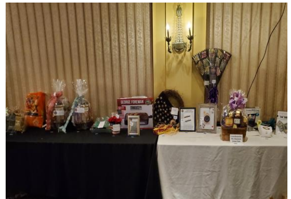
Raffle baskets waiting to be awarded