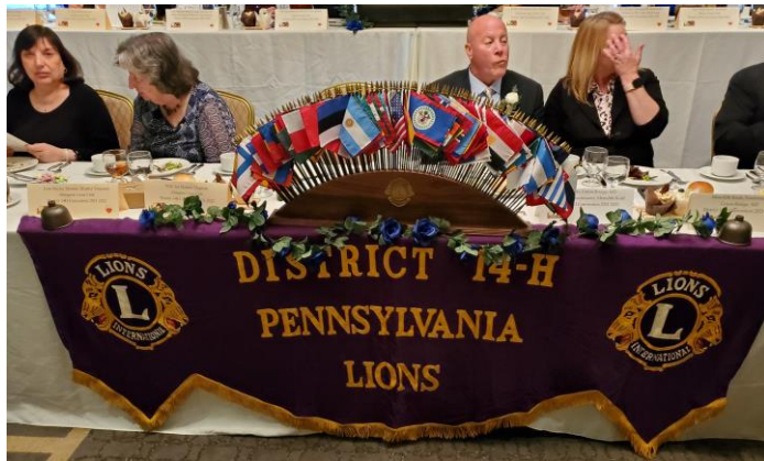
District banner on the front of the head tables