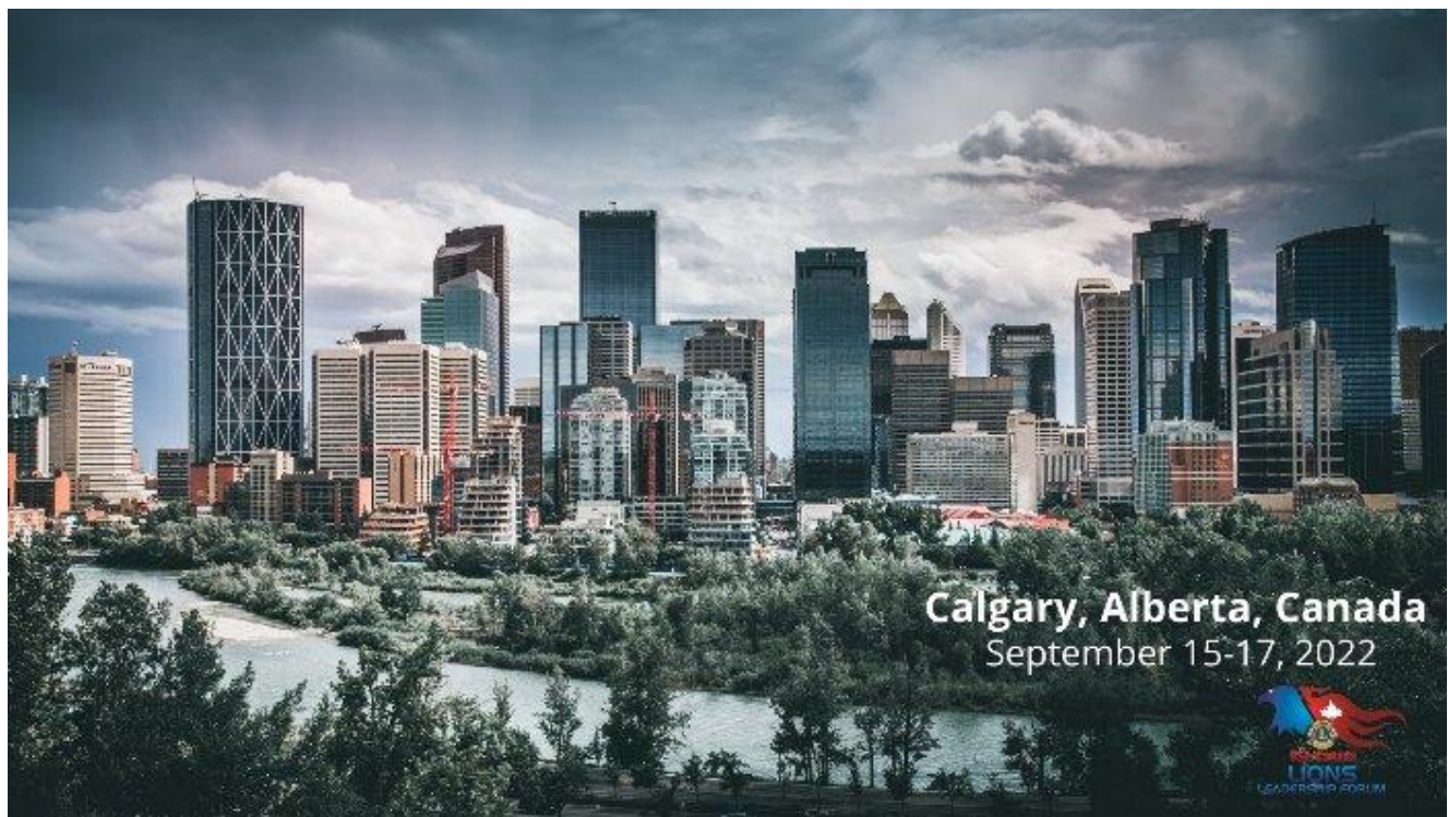
Calgary, Alberta, Canada September 15-17, 2022