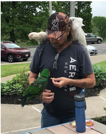
Lots of people, and others stop for a snack