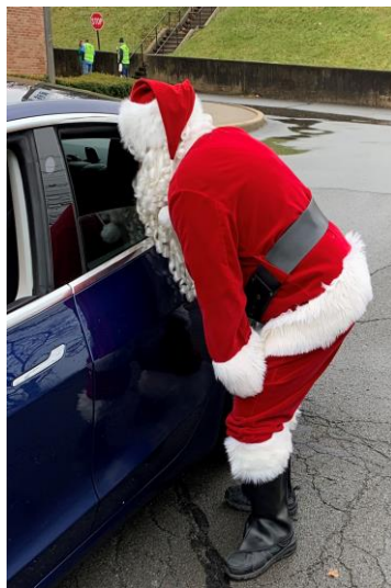
Beep – Beep Hi Santa