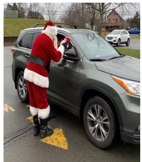
Santa visits children in their car