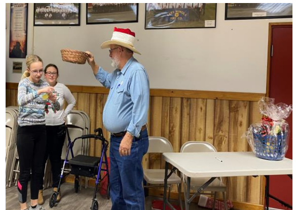
PDG Butch is due on December 25 th .