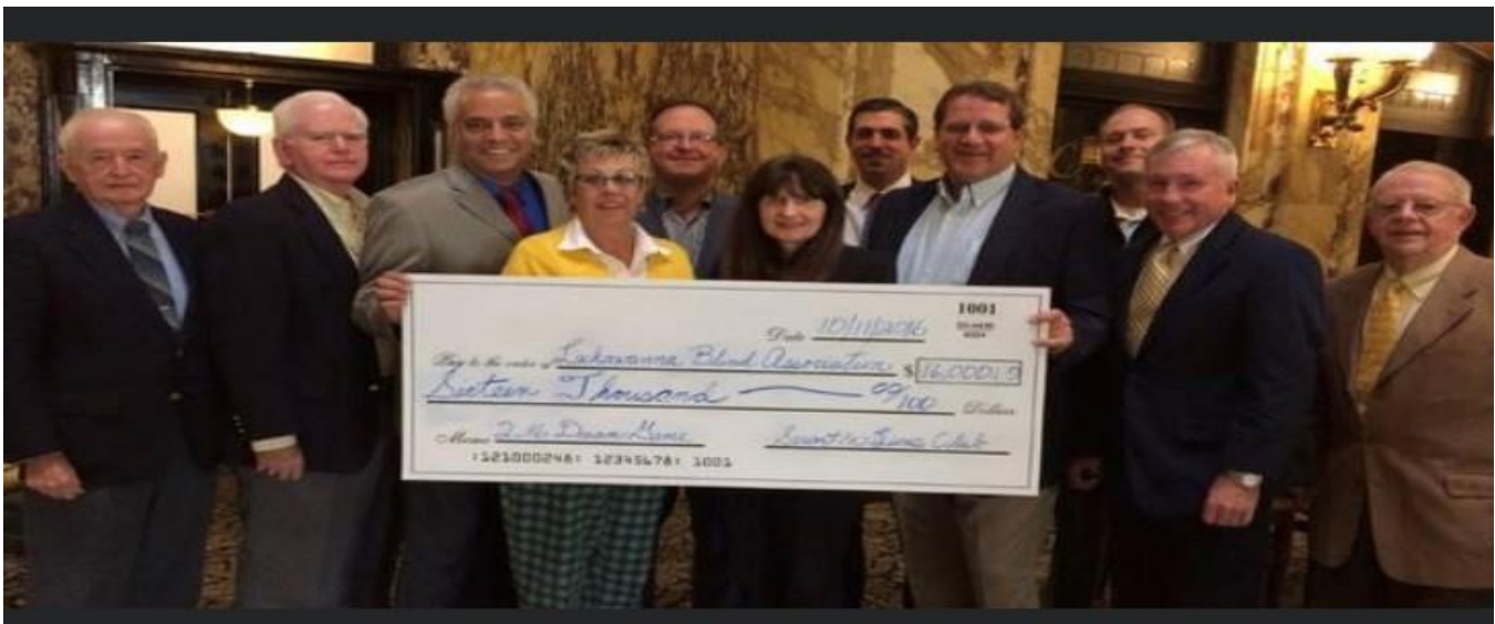
Scranton Central Lions Club presents a check to the Lackawanna Association for the blind for $16,000, the proceeds of the Annual Dream Game L to R