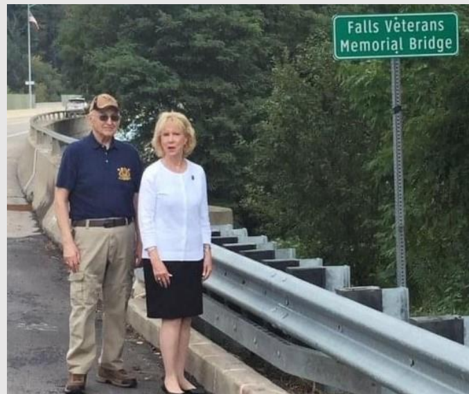
Sept 18th at 11AM. Falls bridge on 92 was named. Falls Veterans Memorial Bridge. Falls Lions Club participate with this event.

October 10th at 11AM Falls Lions Club will be having their last Chicken Barbecue for this year. Price remains at $10. All are welcome to attend. We will be doing 200 chickens so come early.