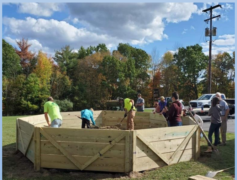
The group making the Gaga game for all in the community, to use. it is at Lake Winola Methodist Church