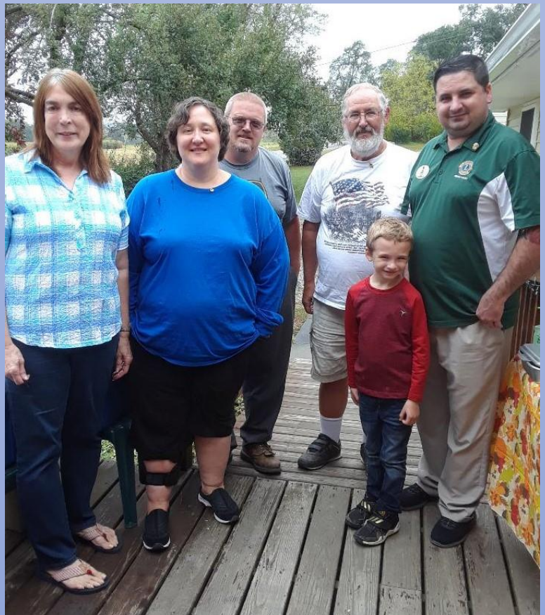
District 14-H Governor Visit to Tunkhannock .