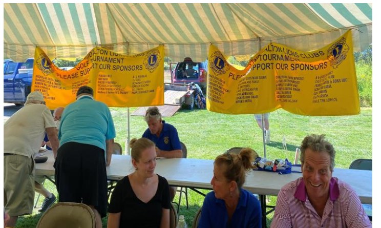
More fun at the Dalton Golf tournament