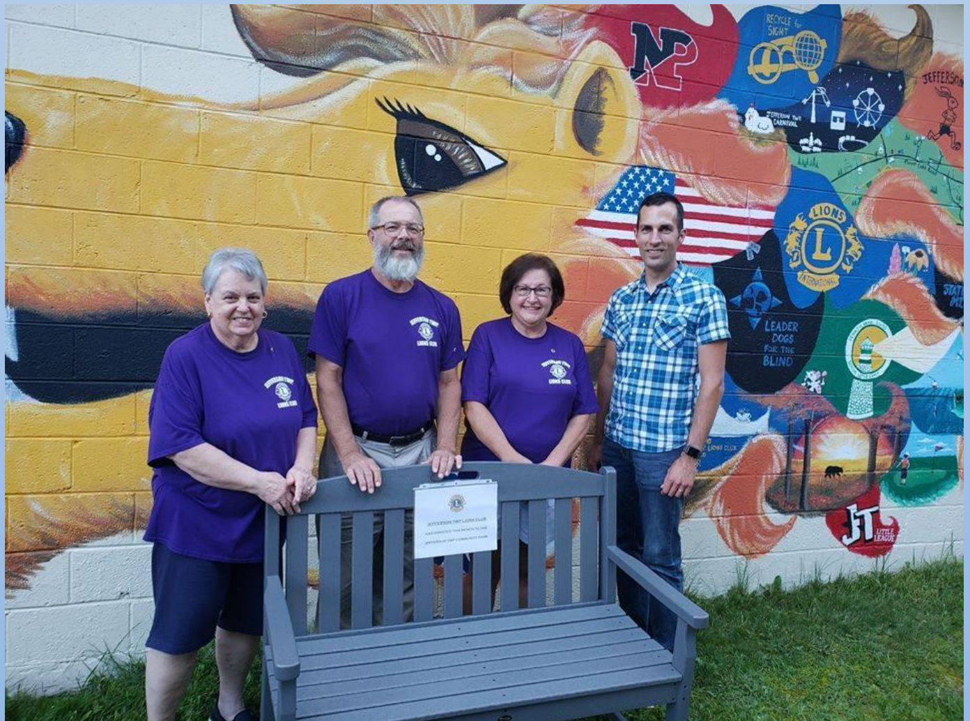
Great picture - Clear - Bright – Colorful